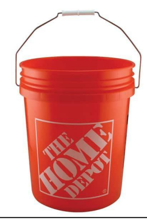
You can substitute a bucket instead and put in multiple places.